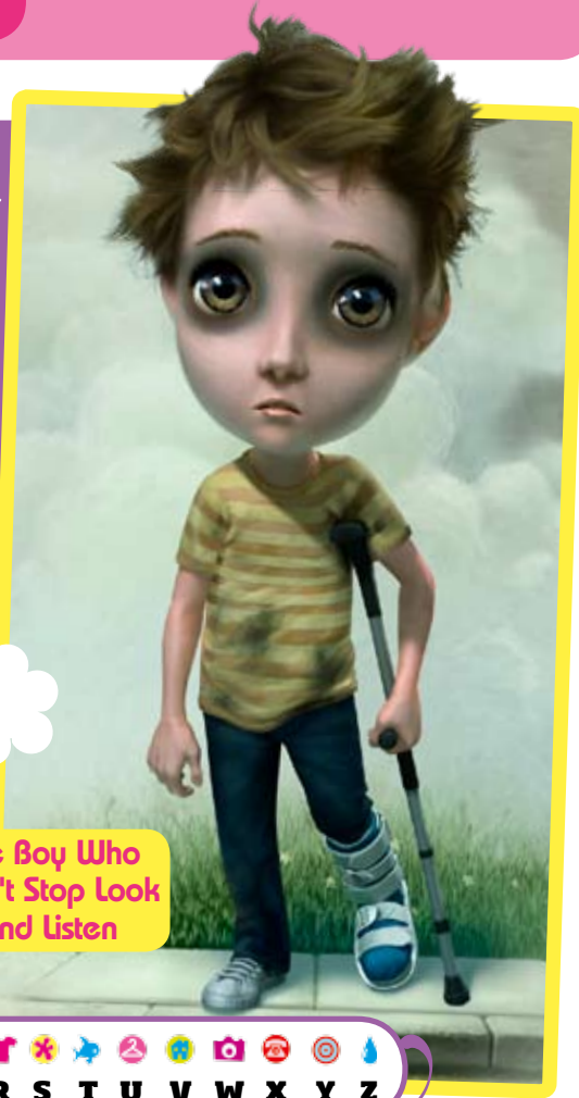
The Boy Who Didn't Stop Look And Listen