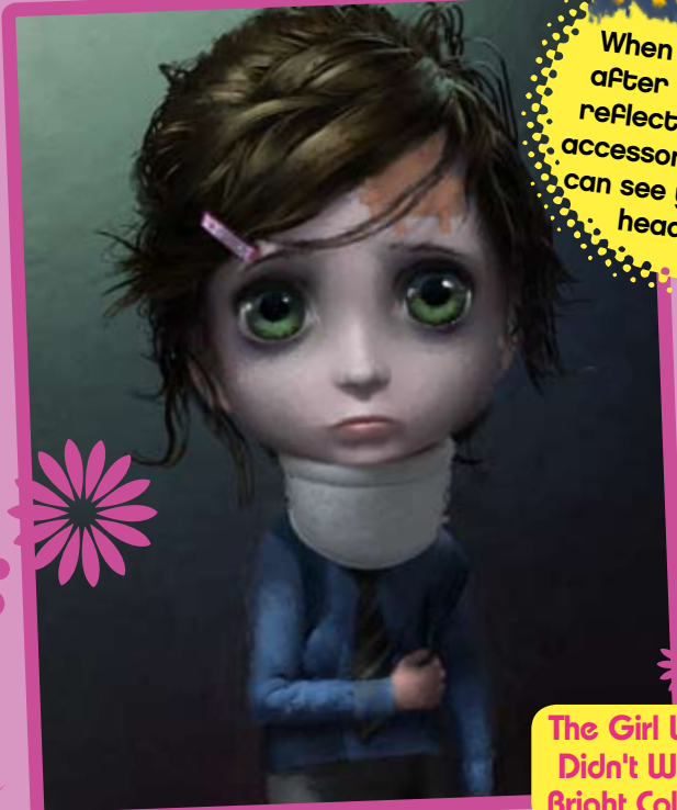
The Girl Who Didn't Wear Bright Colours